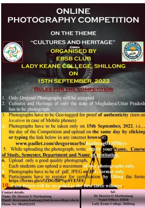
Fig1: Poster for publicity of the programme

The Online Photography Competition “Cultures and Heritage of Meghalaya/Uttar Pradesh” was organized by the EK Bharat Shreshtha Bharat Committee of Lady Keane College, Shillong on 15 September, 2022 for students of the Lady Keane College, Shillong and from paired Colleges from Uttar Pradesh with an aim to know more about the Culture and Heritage of the paired Institutions from Meghalaya and Uttar Pradesh.